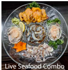
Live Seafood Combo