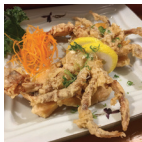
Soft Shell Crab