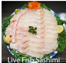
Live Fish Sashimi

<Tempura + Grilled BBQ fish + Sashimi salad + Spicy soup >